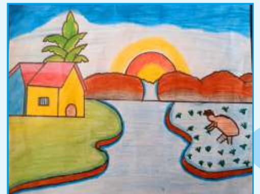
Iaxmi Gadadar Class-5