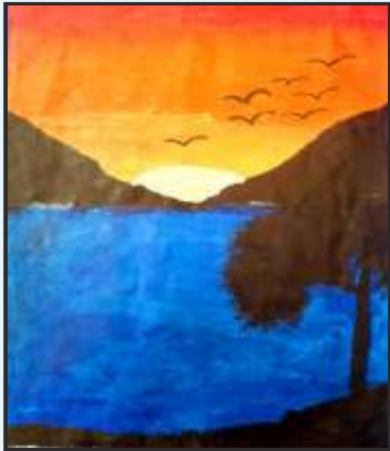
Saanvi Jaggal Class-3