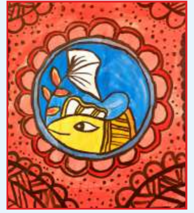
Sakshi Desai Class-5