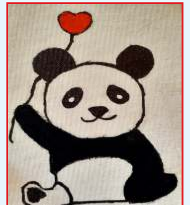
Rishabh Pednekar Class-6