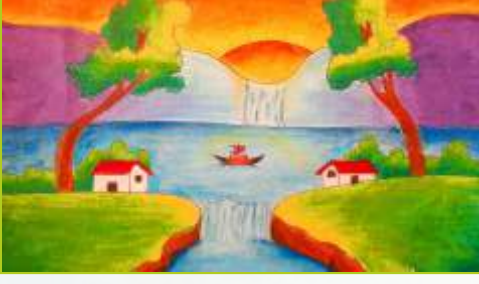
Saifullah Subedar Class-3