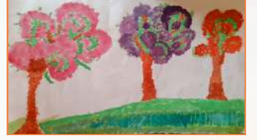
Asmita Inamdar Class-5