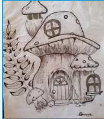
Shreeya Deshpande Class-7