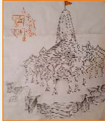
Pratik Pujeri Class-9