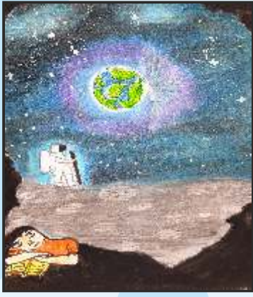
Achal Narasgouda Class-6