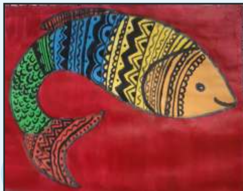
Bibi Ayesha Class-7