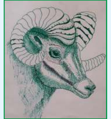
Druva Deshpande Class-7