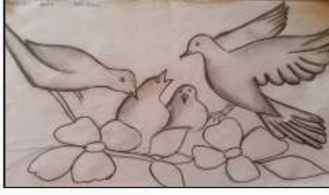
Saachi Patil Class-5